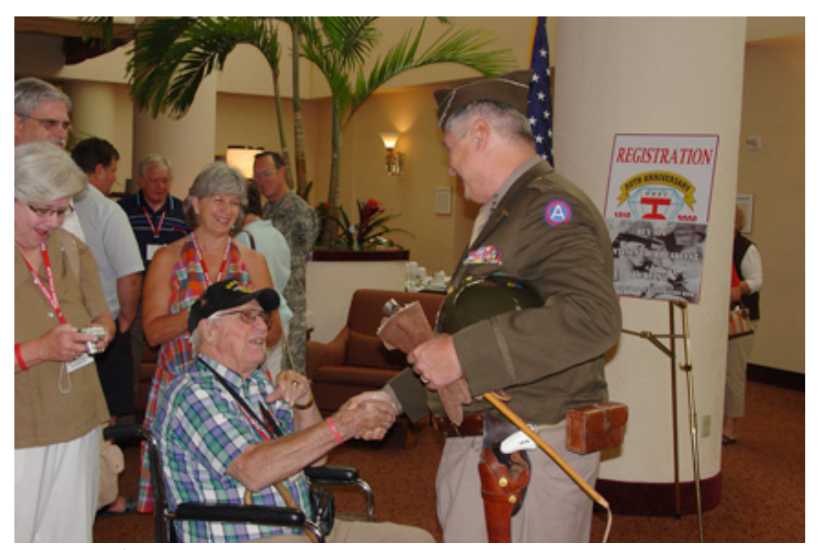
Many 90<sup>th</sup> Vets brought three and sometimes four generations with them. The history of the 90<sup>th</sup> division and the service to their country was once again shared from one generation to another.