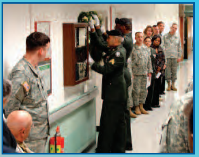
Solemn wreath laying ceremony in front of Patton's hospital room marking the 64th anniversary of his death.