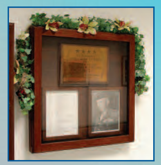
A permanent memorial displayed in front of Patton's hospital room.