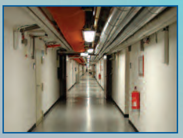
The hallway beneath the hospital was once used to lead horses to and from their stalls. Keeping them below the main barracks would shelter them from the cold of winter and heat of the summer.