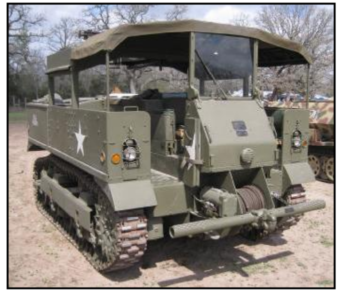
Brent Mullins' M5 High Speed Tractor