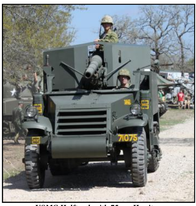
USMC Halftrack with 75mm Howitzer owned by Brent Mullins