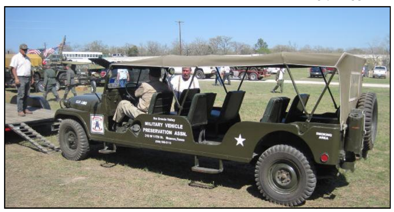
Rio Grande Valley MVPA "stretched" M38A1 Jeep