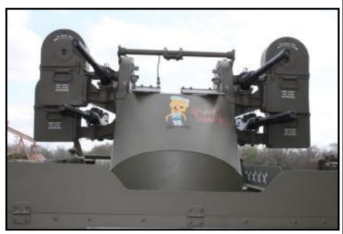
.50 cal. Quad Mount on M16 Halftrack