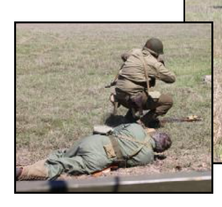
American infantry advances on German lines