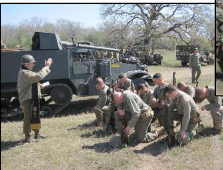
Gen. Patton addresses the troops