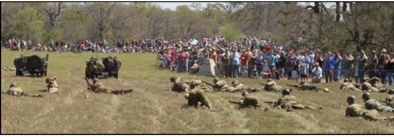
Spectators get a close-up look at the battle