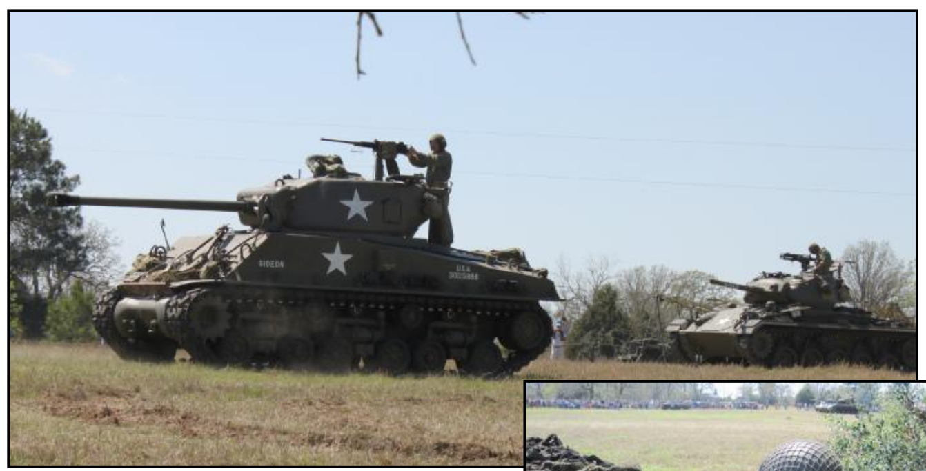
M4 Sherman (foreground) and M24 Chaffee (background)