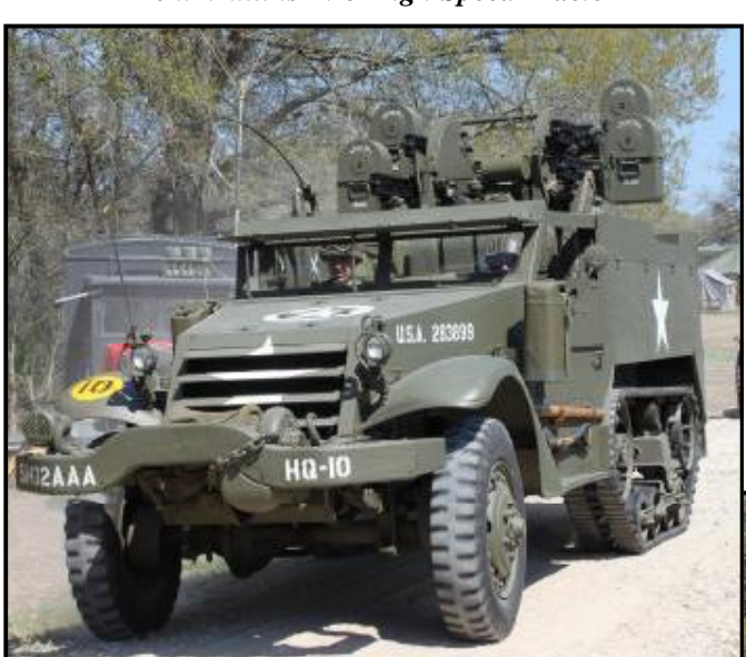
M16 Quad Mount Halftrack