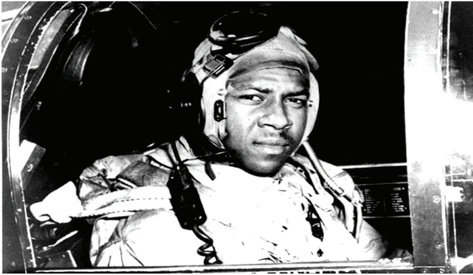
Ensign Jesse L. Brown, USN In the cockpit of an F4U-4 Corsair fighter, circa 1950. He was the first African-American Naval Aviator to see combat. Brown was shot down over North Korea.